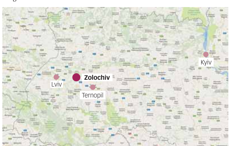
Zolochiv, a Lviv Oblast city of 24,000, is about 450 kilometers southwest of Kyiv and between the oblast capitals of Lviv and Ternopil.

"This allowed us to include more houses in this project, and made people more responsible," he says.