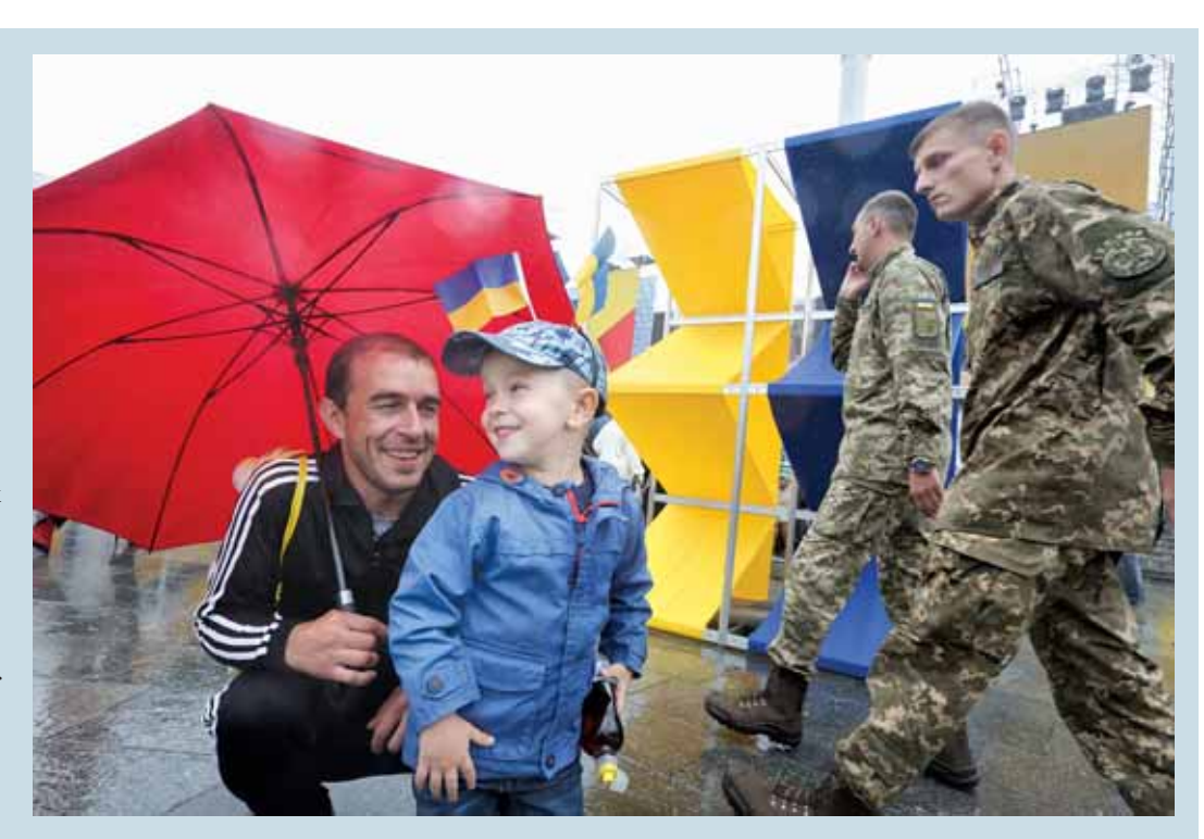
A boy reacts with a smile as his father asks him to pose for a photo on Aug. 24, 2016, during Independence Day celebrations in Kyiv.