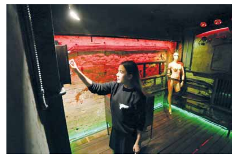
A woman solves a puzzle to find a way to escape one of the Kadroom's quest rooms in Kyiv on July 19.

Titanic: After colliding with an iceberg, passengers are locked in the engine compartment of a sinking ship, stranded in the middle of the Atlantic Ocean.