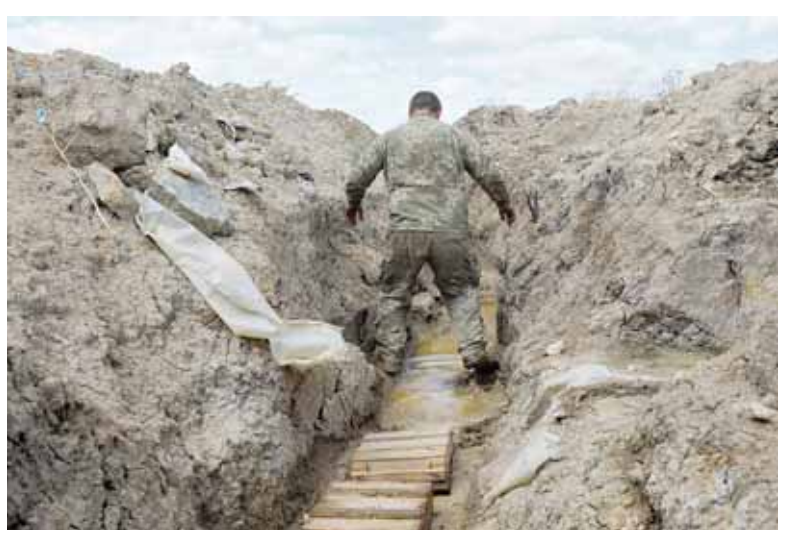
A Ukrainian soldier walks through a muddy trench at a defensive position near the Ukrainian-controlled town of Luhanske in the Debaltseve area on July 31.

"Every night here at the position I see the lights of Debaltseve on the horizon," he said. "I've spent all these three years of war here in this area of Donetsk Oblast, and started to love this place. Who knows — maybe I will see that city once again." ■