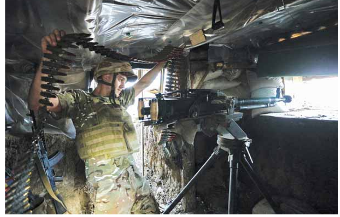
A Ukrainian soldier loads a DShK heavy machine gun with an ammunition belt at a firing position near town of Luhanske on July 31. (Volodymyr Petrov)

During a recent overnight mortar attack on July 31, an 82-millimeter mortar round made a direct hit above one of the shelters. The shell left an impact crater, but nobody in the dugout was hurt—the thick layer of soil covering and heavy timber of the shelter absorbed the blast.