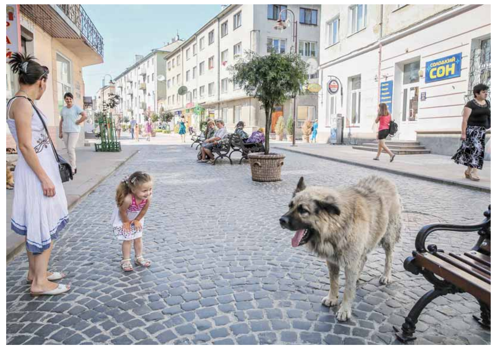
Residents of Zolochiv enjoy a hot summer day in the city's historic center on Aug. 4. The municipal authorities restored the old city's cobblestones in 2012 and made the historic center a pedestrian area. Zolochiv also pioneered Ukraine in the green energy solutions. (Oleg Petrasiuk)